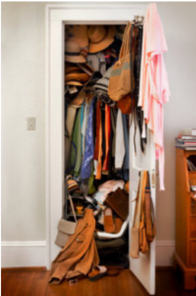
Messy Closet needs organization

Organization is a very good way to keep your house in order so I want to let you in on a few of my, “Money Saving Organization Tips.”