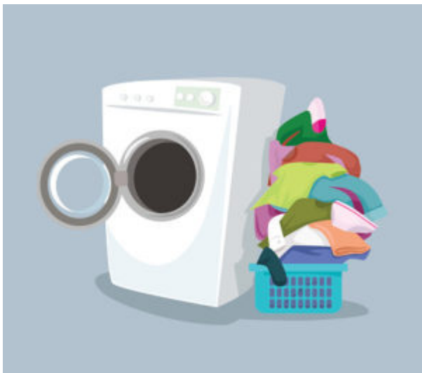
Large loads of laundry

So there you have it 3 laundry soaps to save you money all year round I hope you find this blog useful and help to save you money.