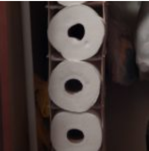
Paper Toweling Organization

Oh believe me I don't have all the cleaning and organization under control but it sure does help to have some areas in a good order.