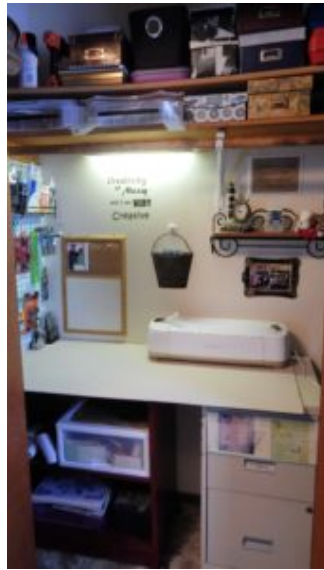
Closet redo to Craft Area

I had gotten a Cricut Explore Air for Christmas from my daughter, I already did scrapbooking and so I needed some room where everything could be so I could work on my crafts without taking up the Dining Room table constantly. Well, I transformed half of my spare bedroom closet into a "Closet To Craft Area On A Budget."