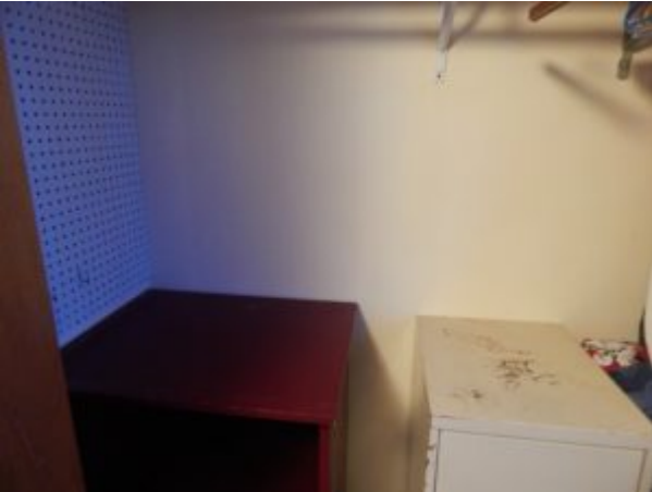
Beginning of Closet makeover.