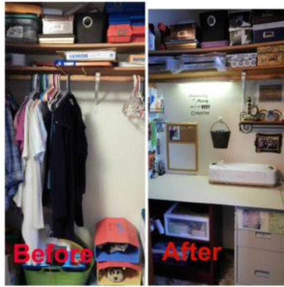
The Before & After Closet To Craft Area

I hope what I have shared gives you some ideas and if you have any comments or questions please scroll to the bottom of this post and there you will find a comment box.