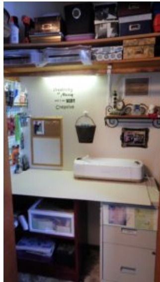
Closet redo to Craft Area

I had gotten a Cricut Explore Air for Christmas from my daughter, I already did scrapbooking and so I needed some room where everything could be so I could work on my crafts without taking up the Dining Room table constantly. Well, I transformed half of my spare bedroom closet into a "Closet To Craft Area On A Budget."