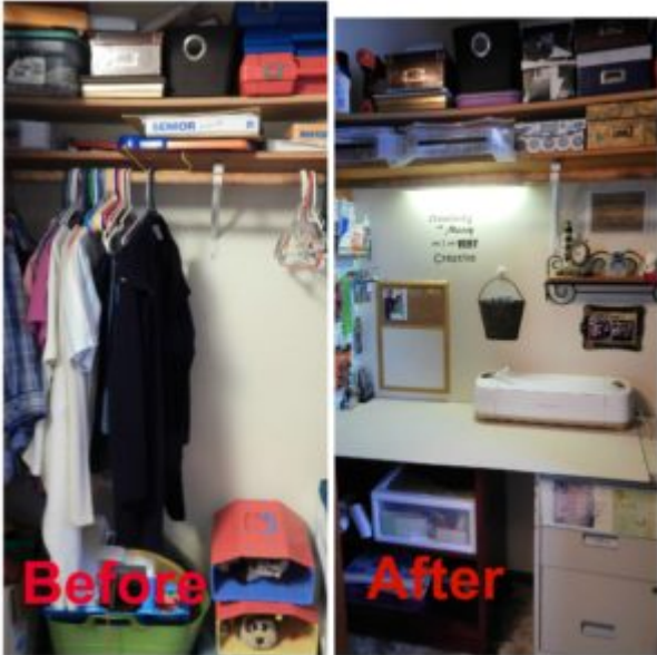
The Before & After Closet To Craft Area

any comments or questions please scroll to the bottom of this post and there you will find a comment box.