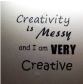
Vinyl Creativity is Messy