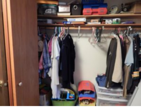
Spare Bedroom Closet