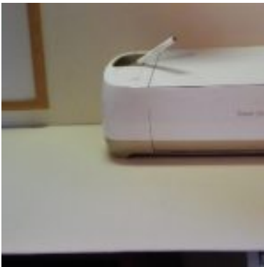
Tabletop made out of plywood and painted.

Now that I have the furniture pieces in there I made a worktop from a piece of plywood and painted it, that didn't cost me anything, because the wood I already had and the paint was left over from another project. The next thing I added was a pegboard, which I also found in the garage from some left over wood, just cut it to the size I wanted with a jigsaw, painted it and screwed it up to the wall. There was already a board on the wall up at the top, but on the bottom of the pegboard I had to add some depth so I added 8 washers to the screw in the back of the pegboard and then screwed it into the wall.