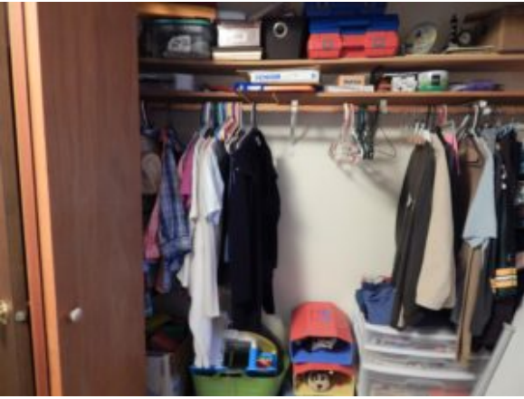
Spare Bedroom Closet