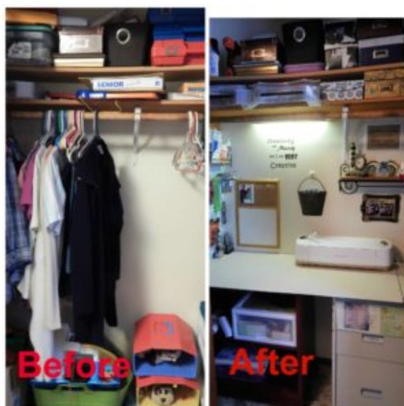
The Before & After Closet To Craft Area

I hope what I have shared gives you some ideas and if you have any comments or questions please scroll to the bottom of this post and there you will find a comment box.