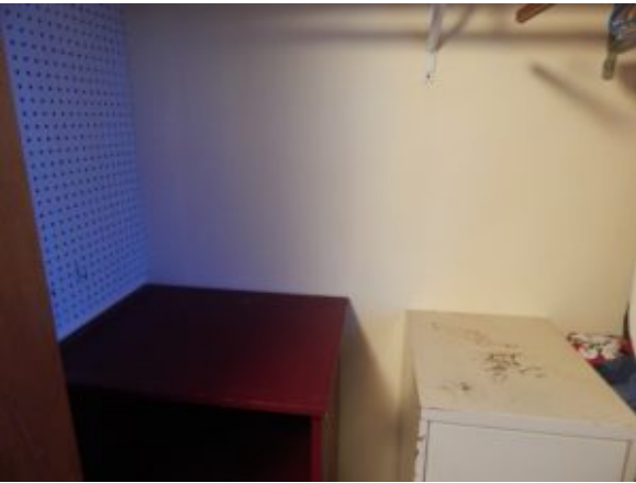
Beginning of Closet makeover.