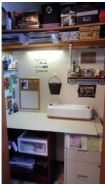
Closet redo to Craft Area

I had gotten a Cricut Explore Air for Christmas from my daughter, I already did scrapbooking and so I needed some room where everything could be so I could work on my crafts without taking up the Dining Room table constantly. Well, I transformed half of my spare bedroom closet into a "Closet To Craft Area On A Budget."