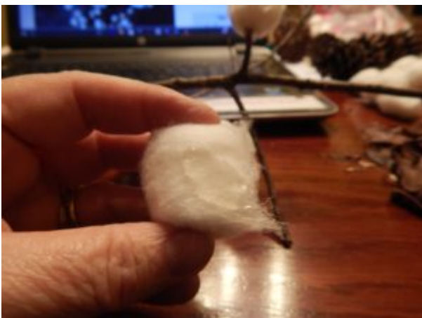
Glue in center of cotton ball

Put a dollop of hot glue in the middle of the cotton ball, I indented mine a little before putting the glue on.