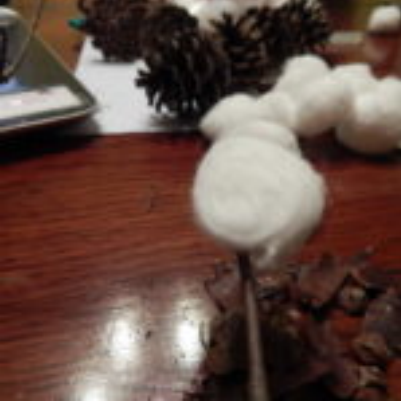
Attached Cotton Ball onto branch.

burn yourself, push the ball down and form it into a nice cotton boll.