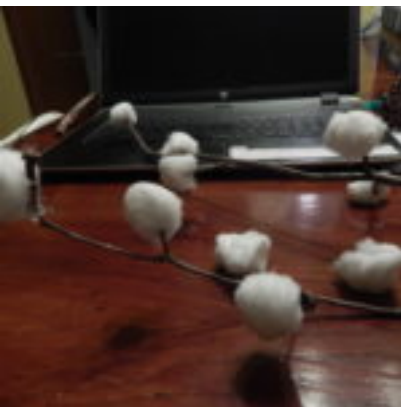
Attaching cotton onto stems

Now it is onto adding your pine cone scales to form your shell