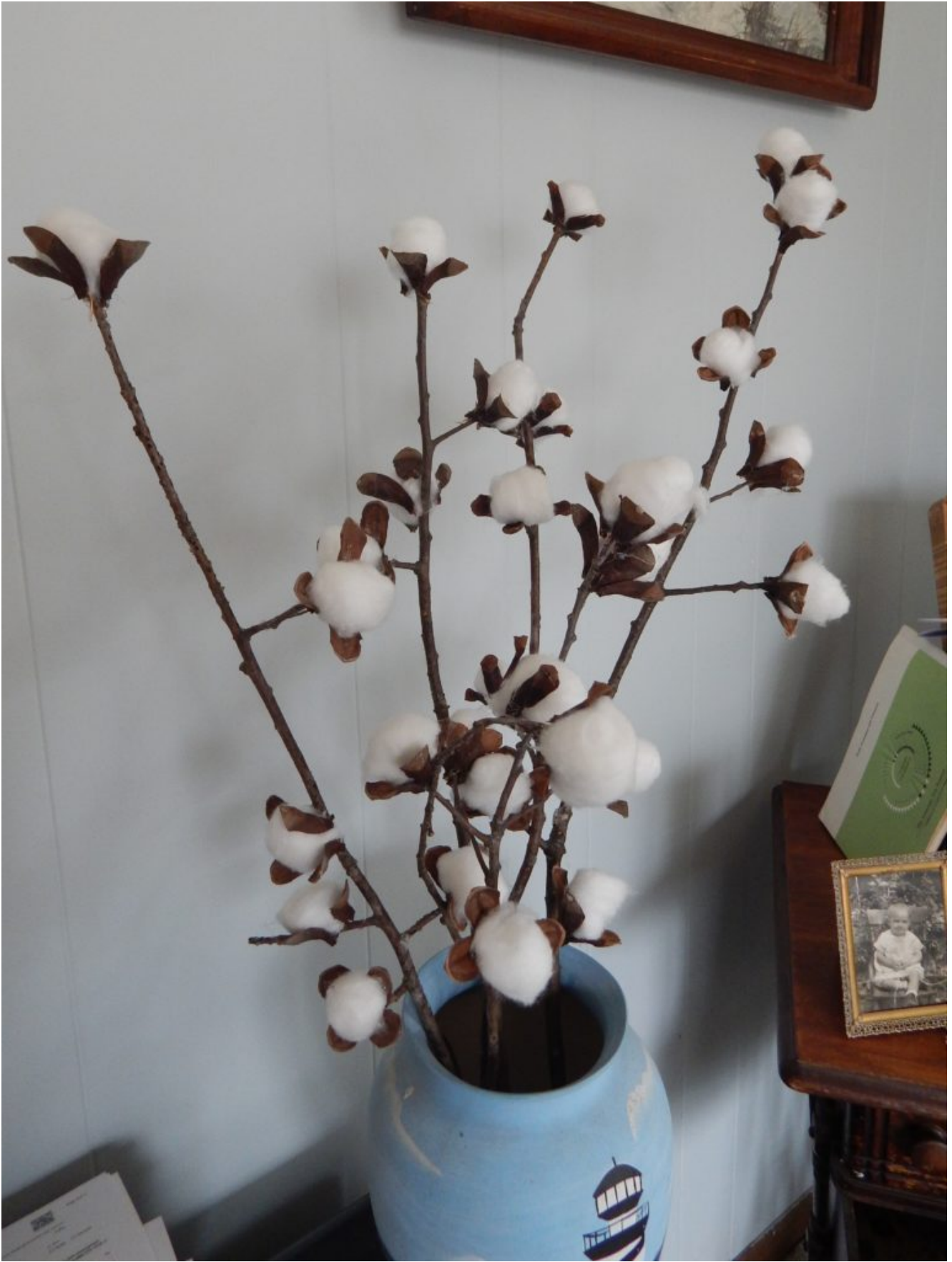
DIY Low Cost Cotton Boll Stem