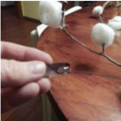
Attaching pine cone pieces onto cotton ball.

for the cotton boll. I used 4 scales per cotton boll, you can judge how many work for your cotton bolls. I put glue down from about the middle of the scale to the bottom so they would stick well on the cotton boll and somewhat on the stem.