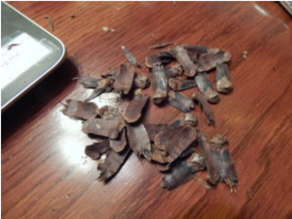
Pine Cone Pieces

have to pull the pieces off the cone, you may want to use a pliers and try to pick cones that don't have the sap on them it can get quite sticky.