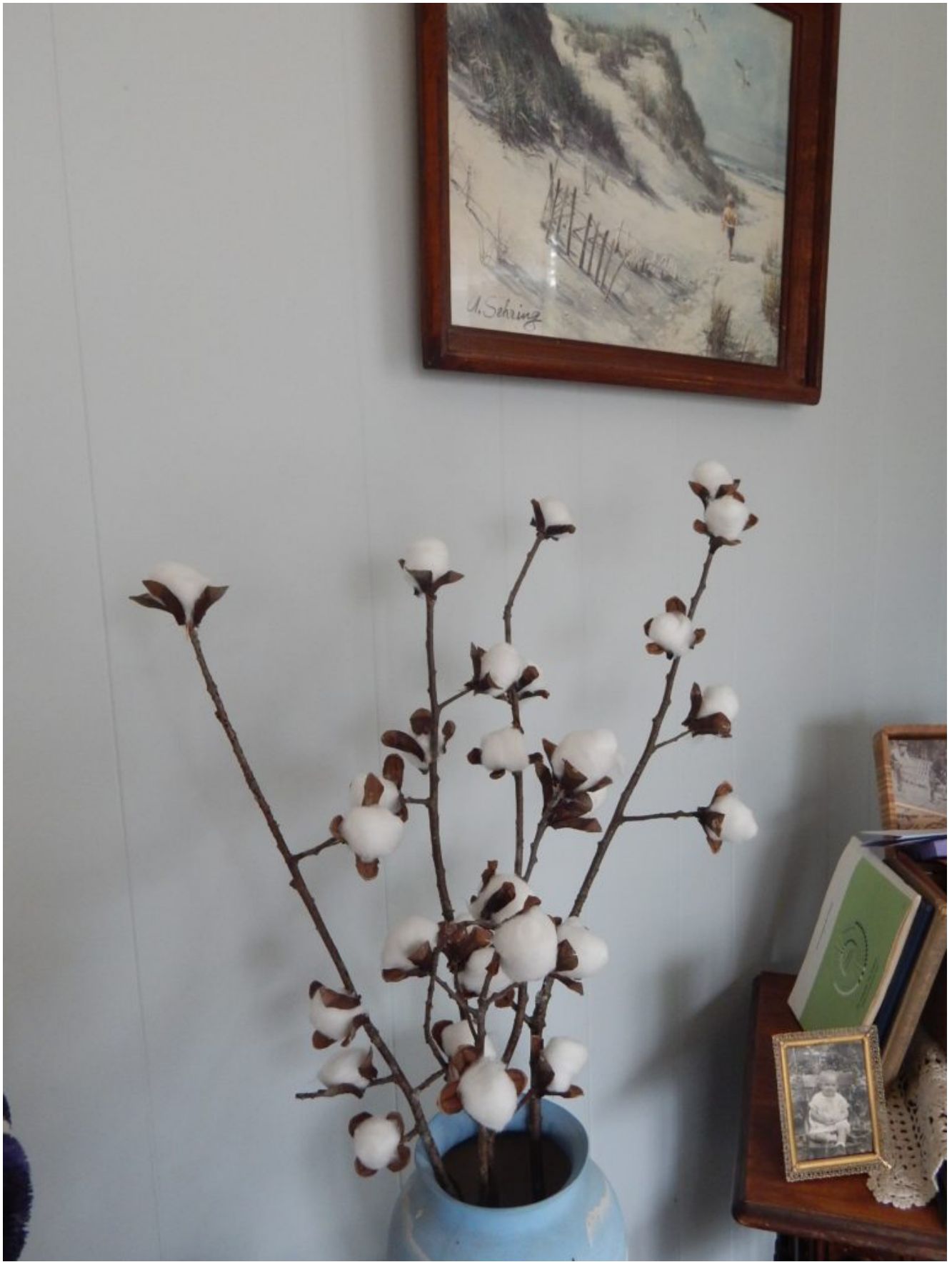
Cotton Boll Stem