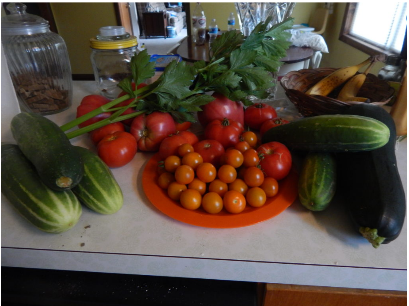
Vegetable Garden Produce

So there you have it how to, “Use Hydrogen Peroxide In Your Garden.” I hope this was useful to you having a beautiful thriving garden.